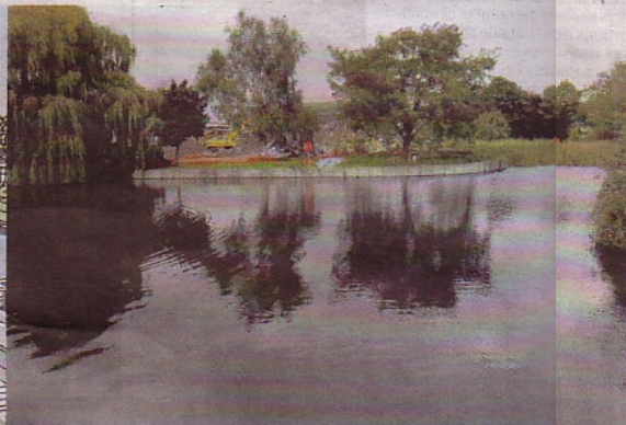
Artist's impression of plans for The Mill Pond at the old GlaxoSmithKline site, Dartford, and, right, how it looks now